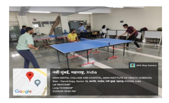
Participants enjoying the game of table tennis